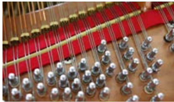
New oval-shaped curved bars

Substantially increased sound volume and magnificent vibration as those of concert halls