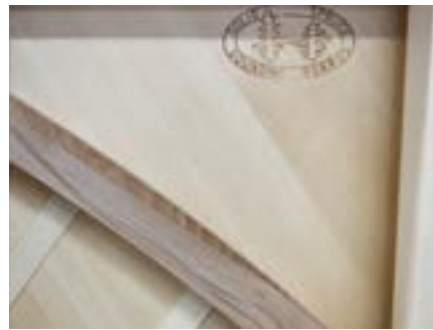
New harmonic structure and soundboard structure that makes sound more energetic

Without any vibration loss and with the right sound delivery, it brings the delicate expression just the way you want