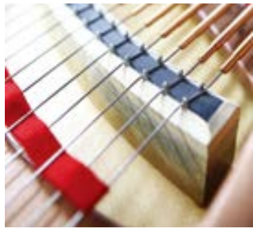
Bridge with new vertical

By combining Young Chang Piano's pure and beautiful sound with delicate technologies, world-class luxurious and innovative sound was born with increased vibration, durability, outstanding balance and European tone.